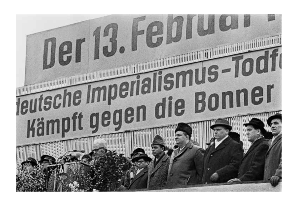
Commemorations of the bombing raids on Dresden - mass rally with Hermann Matern on the occasion of the 20th anniversary of the bombings.

cism of nationalism when it became clear that those critical were "not available for that kind of war. We don't have that kind of relation with a Vaterland [...] that we would be willing to do anything for it."<sup>13</sup> Oliver Kloß for his part describes the choice of peace as rallying point as a means rather than an end: The right of assembly was anchored in the constitution but was in fact non-existent. This contradiction was to be made visible by means of an organized demonstration, provoking the state into its usual repressive reaction, and thus into delegitimizing itself. In appealing for peace the initiators could count on the solidarity of the population.<sup>14</sup> Roman Kalex sees this differently: "It wasn't until those early days