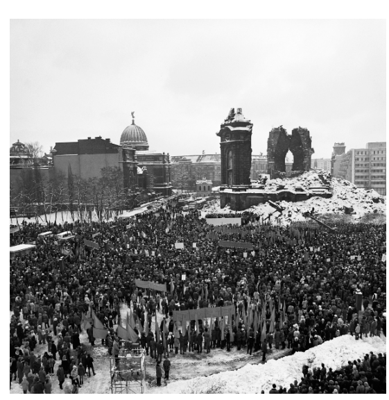
Commemoration on the occasion of the 38th anniversary of the Dresden bombings on the Neumarkt in February 1983.

cific symbolic and ritual form of the peace circle's events: the initiators' invitations always called for participants to bring flowers and candles, and to maintain complete silence during the remembrance. Ziemer describes the candle as a sign of hope, devotion and non-violence, adopted from the Taizé brothers who were touring through the GDR at the time. Roman Kalex regarded the candle simply as a symbol of a better world. The silence in which the act of commemoration took place was to reduce the risk of repression from the authorities, but was also intended as counterpoint to the long propaganda speeches of the SED [Socialist Unity Party], full of repetitions and slogans."We shall overcome" was a deliberate reference to the civil